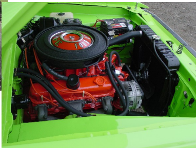
Engine bay after Restoration ishing touch was installing the characteristic rear black stripe to