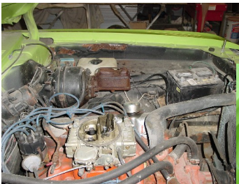
Engine bay before Restoration