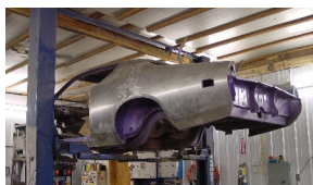
Body stripped and ready for rotisserie and sand-blasting.