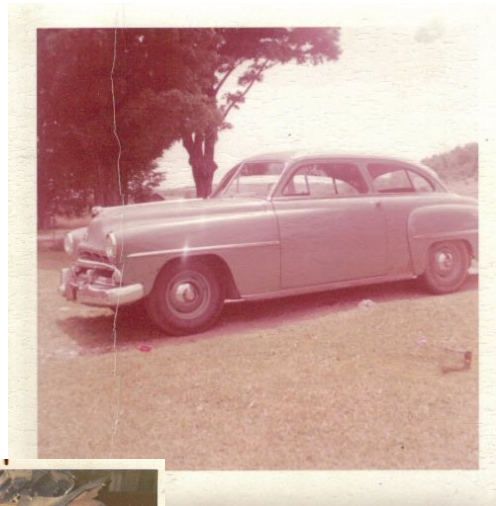
'51 Dodge back in action after tranny was replaced.

Mosko pond (photo on front page) has been around for decades and yes, there are fish in it as many like to ask. There is