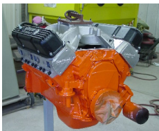
Stroked 440 off the Dyno and freshly painted.