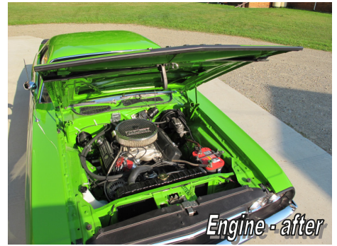
Engine - after

Ann and Mike Hoyt had us restore and paint the body of this 1973 Challenger over a dozen years ago. They just brought the car back to RJ CARS for another round of work and some real nice upgrades. First off, Ann wanted better steering and handling up front. We ordered up a new front suspension kit with power rack and pinion steering from Reilly Motorsports. We also upgraded the front brakes by installing Wilwood 13" rotors with 6 piston calipers. While we were at it, we removed and detailed the engine, engine bay and transmission and took care of some leaks, electrical issues and under hood cosmetics. We finished up with installing some new wheel opening mouldings, a new antenna kit, new chrome mirrors, and a spiffy detailing so the car could head on over to Watkins Glen for the Grand Prix Festival in September. We ran into our usual fair share of road blocks, but the car made it through the shop in time for the show!